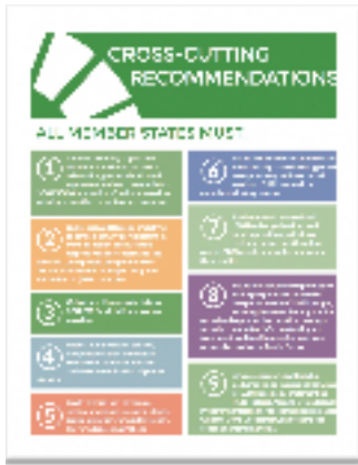
Fact Sheet »