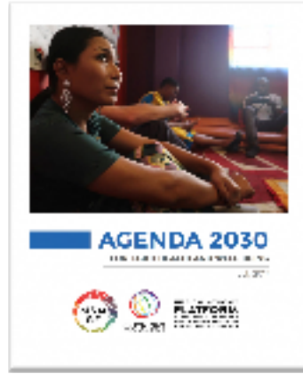
LGBTI 2030 Agenda »

As a result of the advocacy of UN Member States, UN entities and LGBTI civil society, SOGIESC have become increasingly visible throughout the HLPF program.