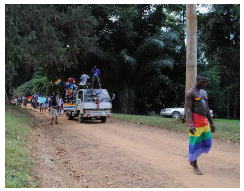
Uganda Pride, 2012.

The review, due to take place next month, presents the opportunity for the court to bring the law in line with the constitution, rather than leaving matters of life and death over to political propagandists.