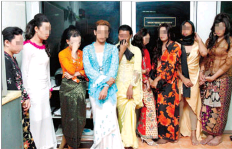
ANTARA ratu cantik 'mak nyah' yang ditahan pada satu operasi di Bachok, Kelantan