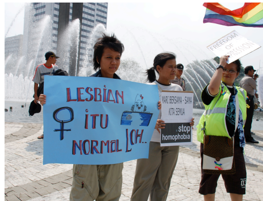
Indonesian LBT activists during International Day Against Homophobia, in Jakarta, 2008.