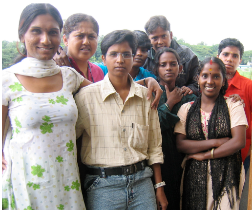
Members of LesBiT, an Indian group based in Bangalore which partners with Sahayatrika, 2007.

In India , violence experienced by heterosexual women parallels violence experienced by LBT individuals, especially in the family and marriage, with the main difference being that violence is also directed against LBT sexual identities and practices. According to Sahayatrika, an LBT group based in the South Indian state of Kerala, the impact of violence is different because there is no social recognition of lesbian identities and relationships or changed gender, and in much of India same sex is criminalized. Forms of violence include forced marriage and punishment by family members for exercising sexual choice. Types of