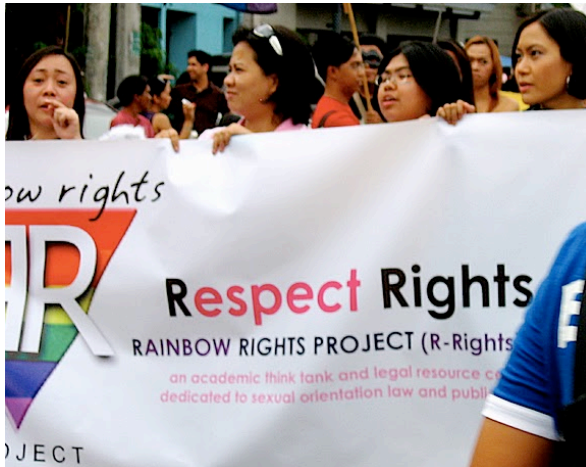
Members of Rainbow Rights at Manila Pride, Philippines, 2008.

violence, verbal abuse, intimidation, and public ridicule. Perpetrators are usually family members. Other perpetrators include church leaders, students, teachers, employers and co-workers. Young lesbians also experience physical punishment from parents, corrective rape organized by a family member to “cure” them, forced psychiatric treatment for mental illness, and “pray-overs” by religious groups to “convert” them to heterosexuality—which sometimes leads to suicides. Transgender people are denied access to public places