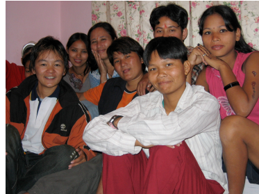
Members of Mitini, a Nepalese LBT group that partners with Blue Diamond Society, 2007.

In Pakistan , LBT activists report that national laws do not recognize the forms or reasons for violence that LBT people experience. Most violence against sexually and gender non-conforming women is committed by family members. According to the Organization for Protection & Propagation of Rights of Sexual Minorities (OPPRSM), family-based violence usually involves forced home confinement, mental and psychological abuse that causes shame and self-hatred, pressure to marry, expulsion from family events, silent treatment by the family, and childhood sexual abuse. In some instances, there are honor killings by the family. Lesbians in heterosexual marriages also experience violence from their male partners, which includes physical and verbal abuse and public outing of their sexual or gender orientation, which leads to further risk of abuse by the community. Psychiatrists perpetrate violence by forcing LBT people to undergo psychiatric treatment including hormone tests. LBT activists in one group observe, “There is no queer movement per se, and the women’s rights movement is not openly supportive and often cautious” which limits avenues for relief and safety from violence. One group’s preliminary research shows that violence against LBT people in Pakistan is rarely visible or publicized compared to violence against gay men.